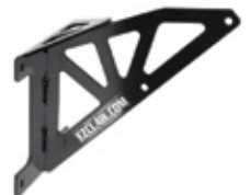
Flange Bracket 81-2301 $94.38

ONLINE ORDERING AVAILABLE. ONE CLICK AND YOU'RE EQUIPPED FOR THE LONG HAUL