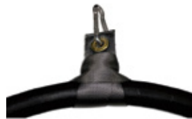
Self Adjusting Sling 81-2306 $16.30