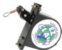
Hydraulic Tensioner 81-2305 & 81-2300 $310.80 & $302.40

Fits on Grote UltraLink 3 in 1's. Holds up Power Cords, Airlines & Secures Most Hydraulic Hoses,