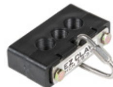
Hose & Cable Holder 81-2303 $53.19